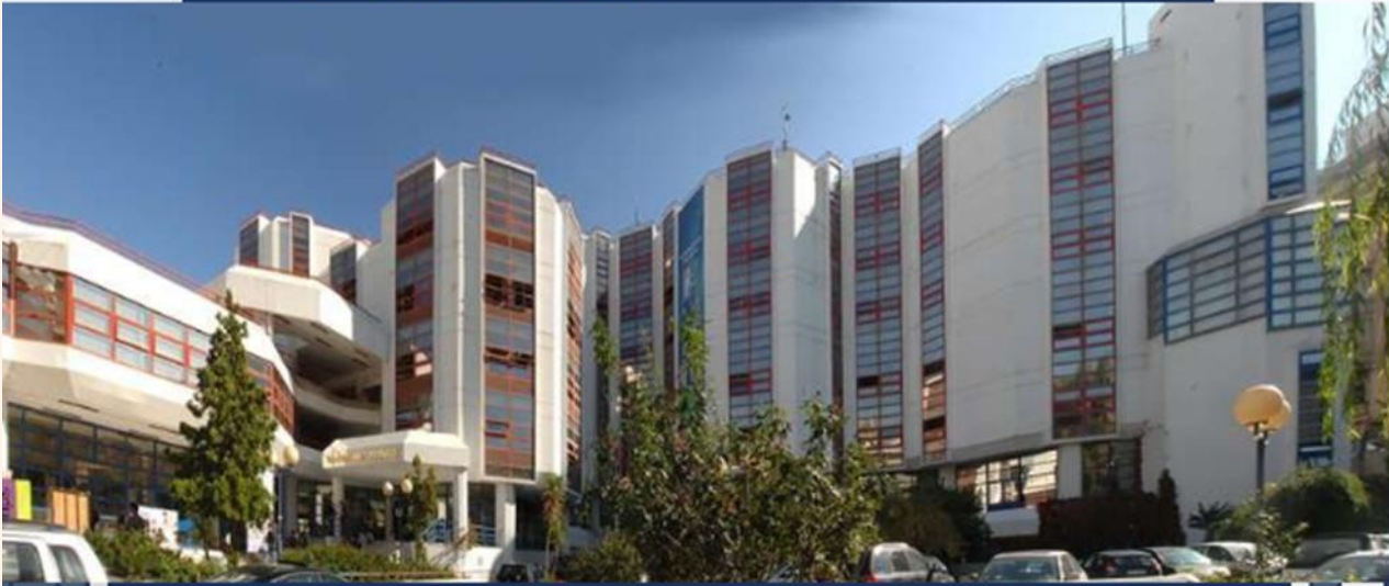
CENTRAL BUILDING Karaoli & Dimitriou Str