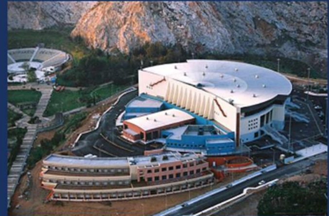
Nikaia Olympic Weightlifting Hall